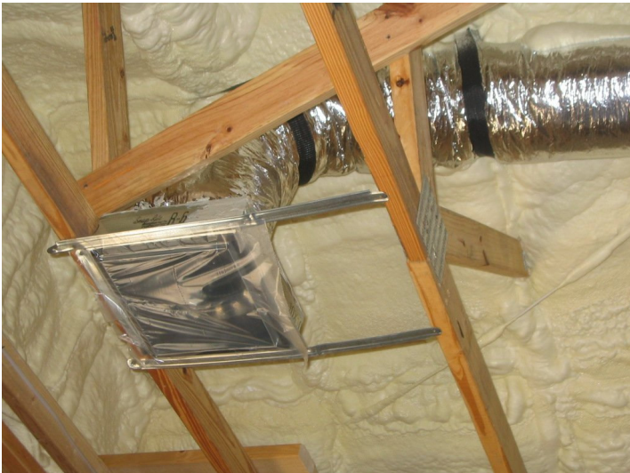
Figure 3: Interdependence of open-cell foam and HVAC system in a conditioned attic application

Open-cell insulation, when qualified as an air barrier, is an effective solution to maximizing air control and minimizing related problems.